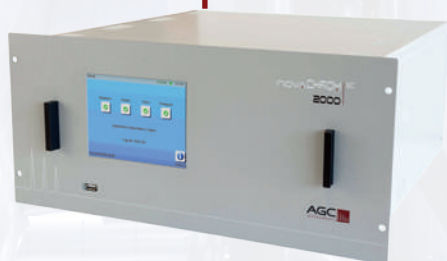
AGC NovaCHROM 2000 GC with ADD